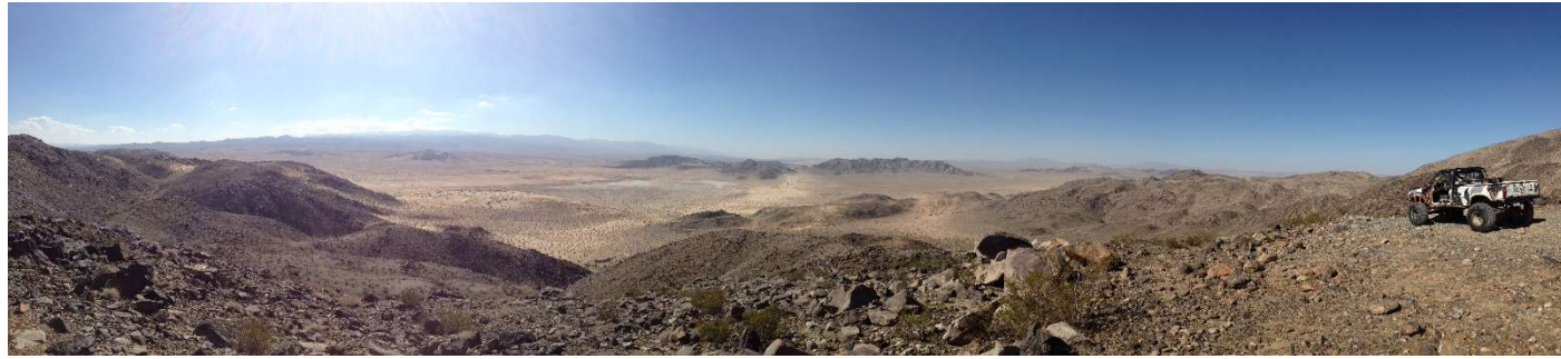
Means Dry Lake after it rained 4 inches in 18 hour period October 2018.

January February March 2023 An award-winning publication. A monthly publication of the Dirt Devils a 501(c)(7) corporation 960 N Tustin St #120 Orange CA 92867 http://www.dirtdevils.org/